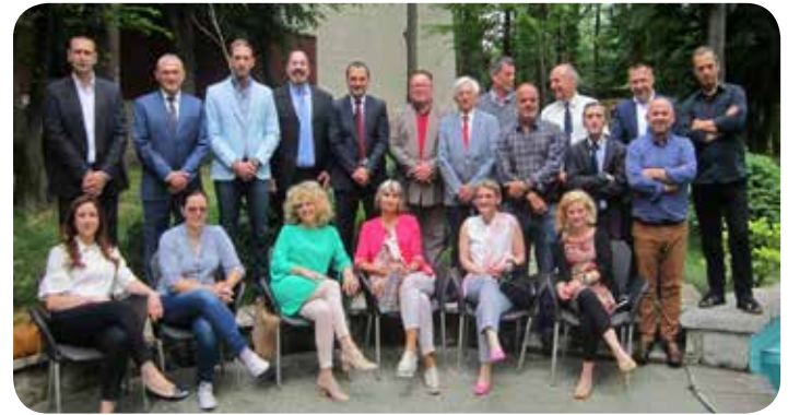
Drug Policy co-operation between Civil Society Organizations (CSOs) and national authorities in South East Europe