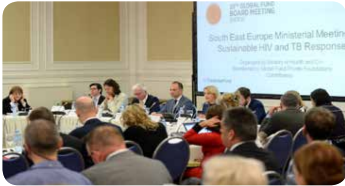
South East Europe HIV Ministerial Meeting