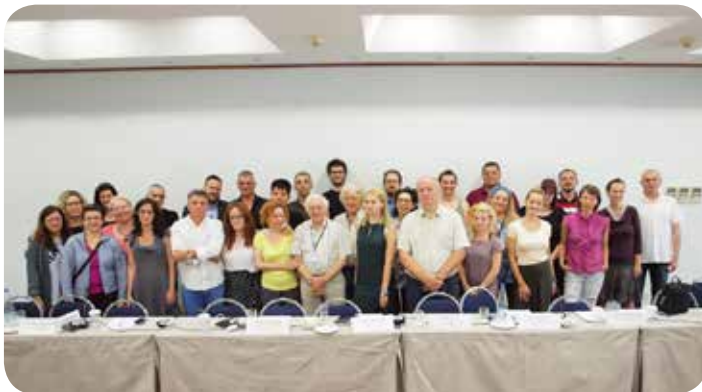
Regional Conference at Thessaloniki, 8 – 9 June, 2018