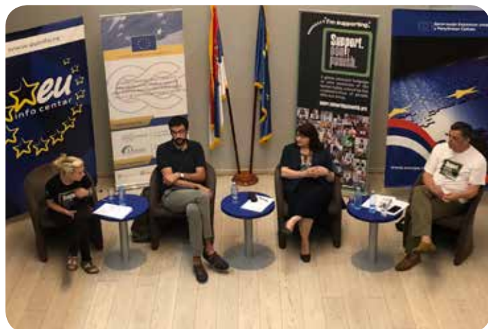
Long list of activities in the Support. Don't Punish campaign in South East Europe