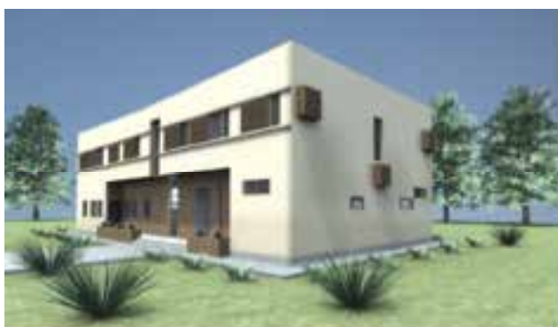
Image of the project documentation for the construction of the rehabilitation center for female addicts

Within the project "Strengthening NGO capacity and promoting public health and human rights oriented drug policy in South Eastern Europe", NGO "4 LIFE" is conducting a survey on the status of addicts serving prison sentences. The results and the recommendations of the study will be published on the websites of NGO "4 LIFE", the project partners and other relevant organizations and institutions.