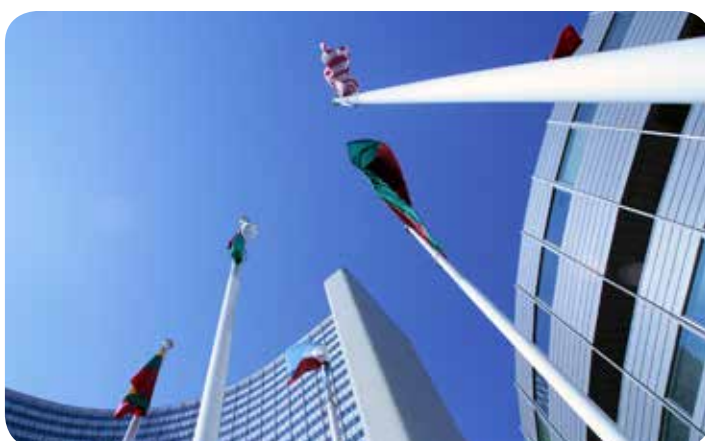
Re-interpreting the Conventions on Drugs Translation of the UNODC document "Drug policy provisions from the international drug control Conventions"

"Positive Voice": Events and Actions on World AIDS Day & European HIV- Hepatitis Testing Week