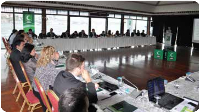
UNGASS Regional Consultation Meeting Eastern Europe and Central Asia