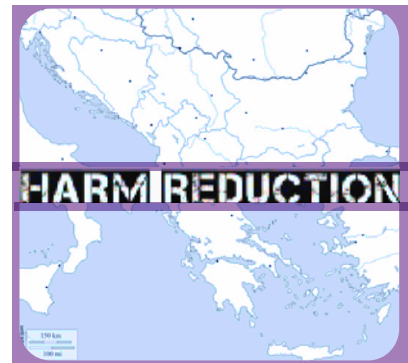
Research on Harm Reduction in SEE

News from the organizations of the Network