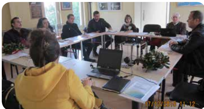
"Drug Strategy and Drug legislation" Meeting in Albania Meeting in Serbia

News from the organizations of the Network